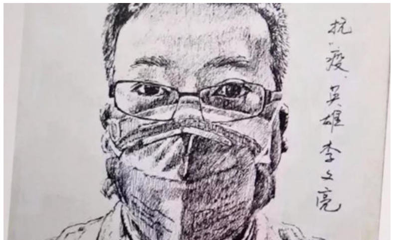
Chinese whistleblower Li Wenliang who issued an early warning that was suppressed by government authorities

The SARS-CoV-2 outbreak could have been contained early on and the vast majority of what followed could have been prevented. This did not happen explicitly because of false and fatal governmental as well as WHO guidance in the early months of the coronavirus outbreak (which probably started in Wuhan in September 2019). This also explicitly did not happen because Chinese government authorities stifled free speech, censoring any attempts of frontline hospital physicians in Wuhan to warn the world about what they saw as severe SARS-like symptoms in their patients in late 2019. Whistleblowers like Dr. Li Wenliang and his colleagues were arrested. As one op-ed in The Guardian (2020: 1) put it: “If China valued free speech, there would be no coronavirus crisis.”