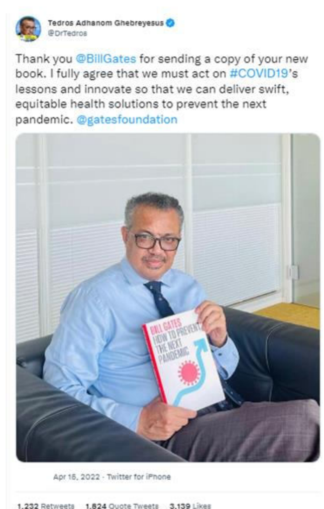
WHO Director-General Tedros Adhanom Ghebreyesus poses in support of Bill Gates' new book on Twitter.

Since funds now come with caveats, the organization is compromised on a number of issues that involve the interests of its donors. The private sector and also most state